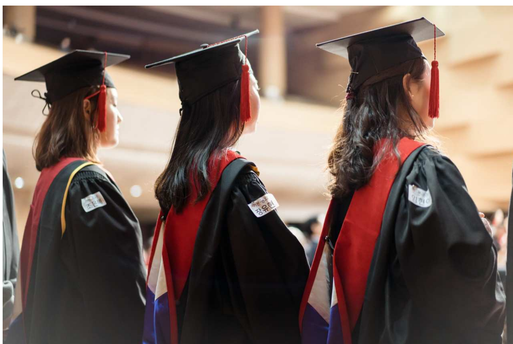
Graduation photos taken on February 2, 2020

He gives us all of this. These are not according to our own plan. Though they were prepared for us since the beginning of time, they